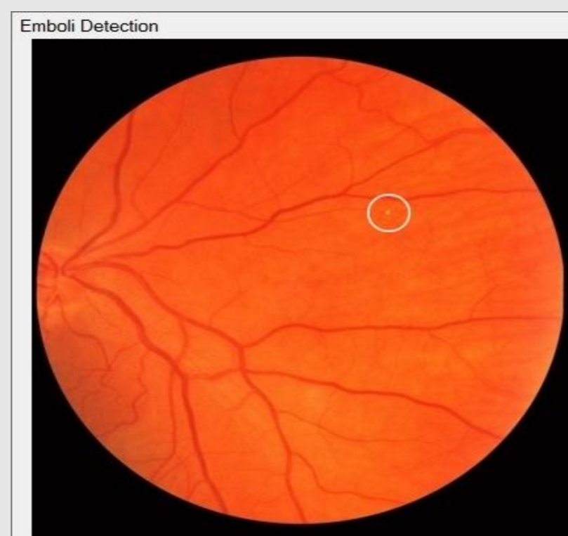
Figure 3 – Emboli Detection